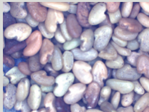
Astragalus alpinus seed. ~ 216,000 seeds per pound, 2 - 3 mm long

Since alpine milkvetch is a legume, it adds to the nitrogen in the soil—thus helping other plants to survive. Arctic plant studies of nitrogen fixing plants in Alaska (Allen, 1995) have found that rhizobia are associated with Astragalus . They hypothesize that these types of legumes help create a healthy ecosystem. This indicates the importance of adding legumes to the revegetation mix.